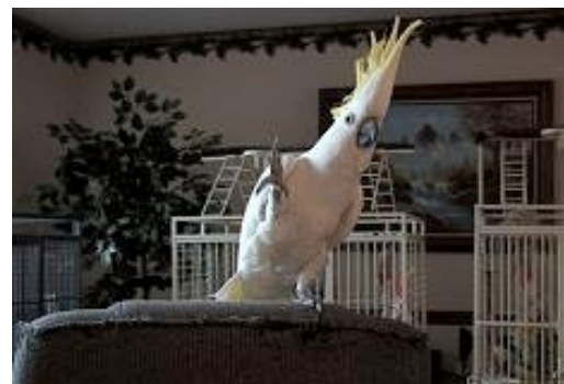
Figure 1. Snowball, a dancing sulphur-crested cockatoo

In 2007 a video of a cockatoo dancing to music appeared on the internet (see YouTube: “dancing cockatoo”). The bird (named Snowball, Figure 1) appeared to be well synchronized to the musical beat, and quickly became an internet sensation (with over 3 million views to date). However, it was not clear if Snowball was receiving timing cues from humans (who might be dancing off-camera), or whether he could adjust his dancing to match different musical tempi (a key feature of BPS). To address these issues, we have conducted an experimental study of Snowball’s dancing by adjusting the tempo of his preferred song and videotaping his dancing while ensuring that humans in the room were not dancing along with the music.